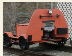
Model 52H, circa 1947-1957

I am glad I took the time to investigate and learn something new. I would also like to see if we could get one of the museum's speeders to run for a while by next summer.