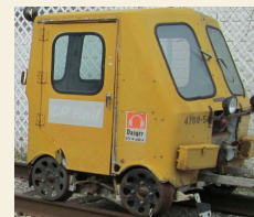
Model M19, built later up to the 1980s