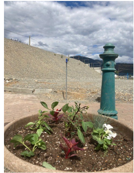
Pocket Park with new potable water pump

Chief Administrative Officer / Chief Financial Officer, Village of Lytton