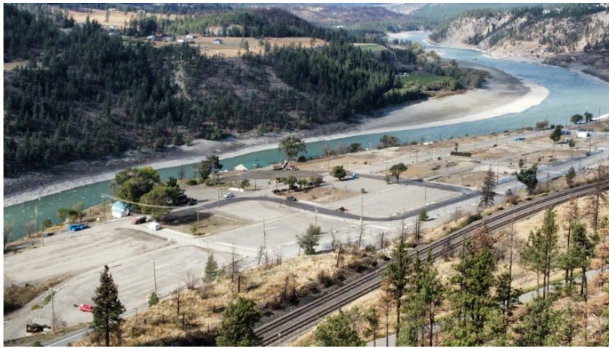
Backfilling and clearing Village lots