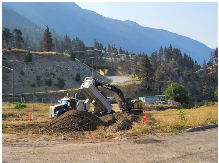
Backfilling in Village