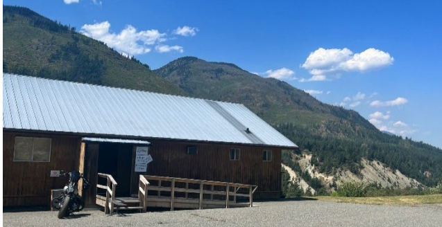
Temporary Village Office at Old Mill Site

In 2023, the Village of Lytton focused on both core municipal operations and recovery operations. Some of the key accomplishments are described below.