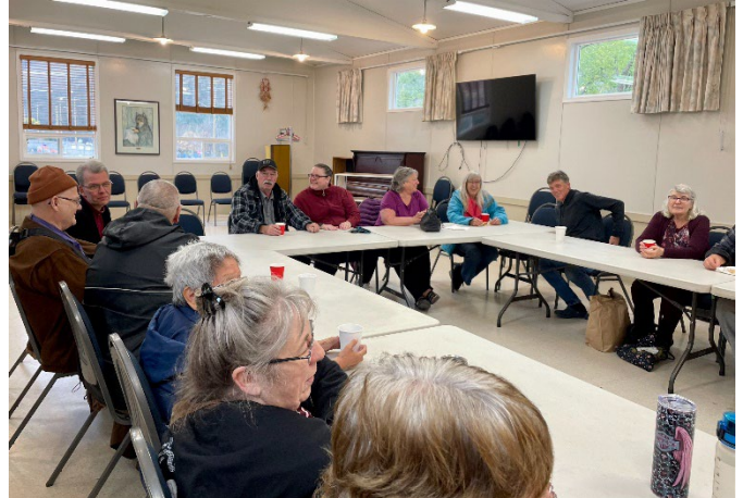
Community meeting at Parish Hall