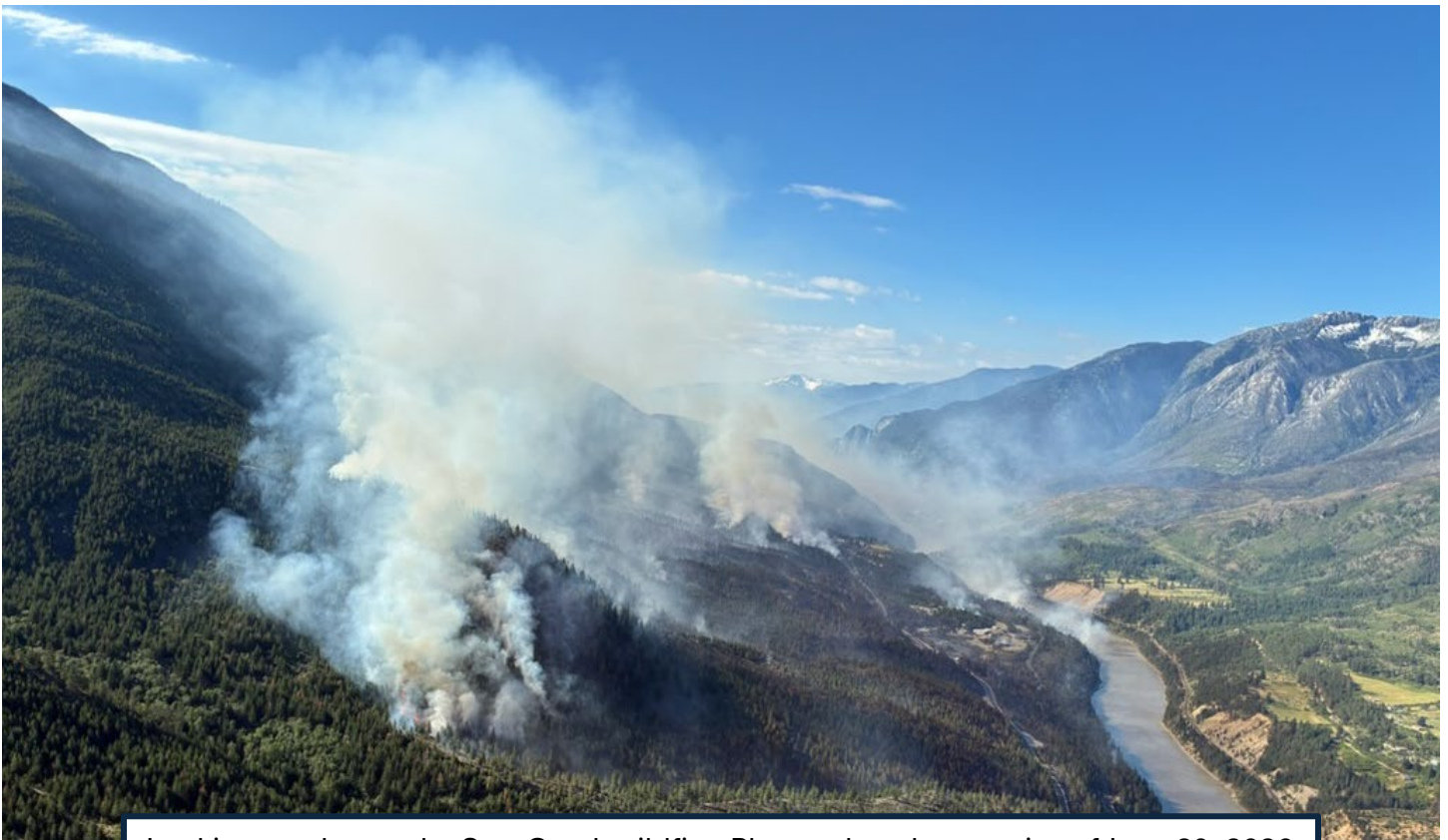
Looking south over the Saw Creek wildfire. Photo taken the morning of June 20, 2026