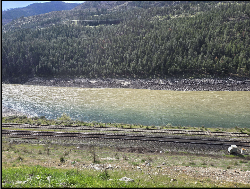
Confluence of the Thompson and Fraser Rivers.