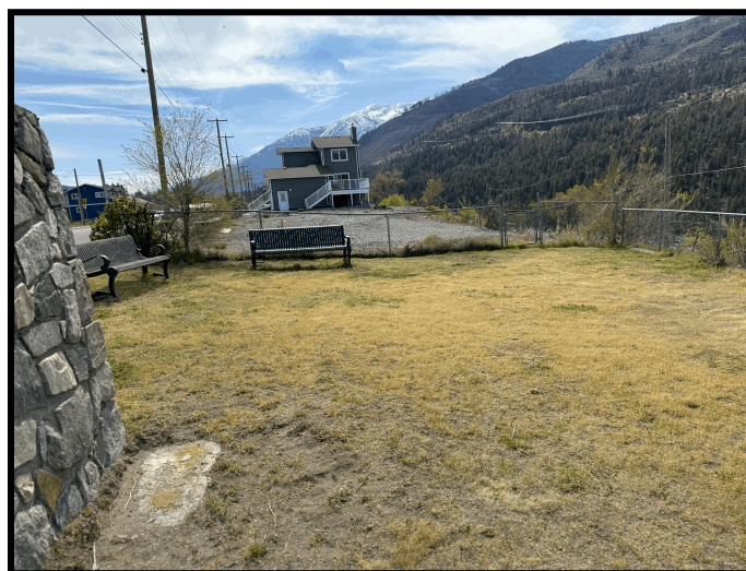
Lytton Pocket Park